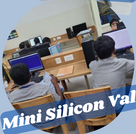
Mini Silicon Valley