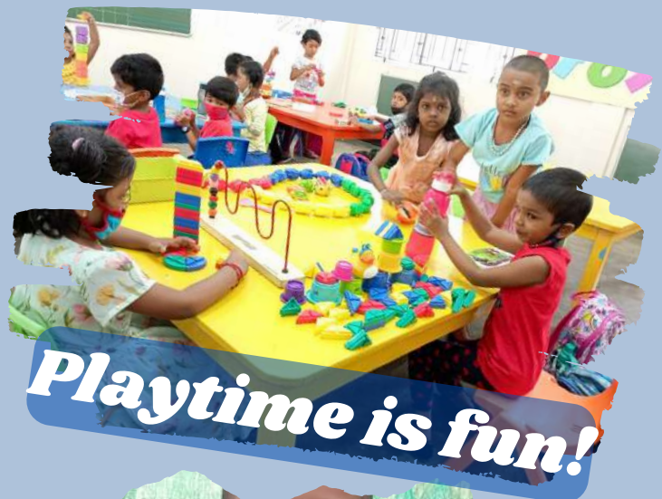
Playtime is fun!