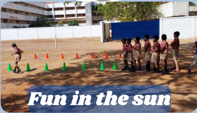
Fun in the sun