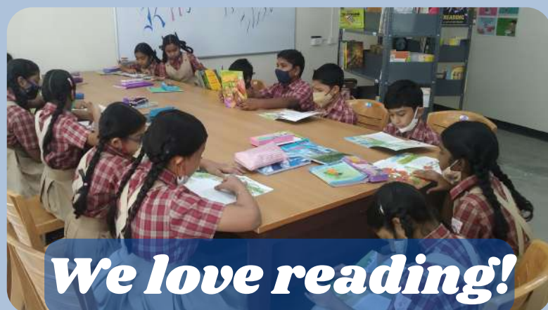
We love reading!