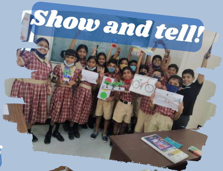
Show and tell!