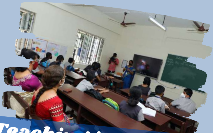
Teaching in progress