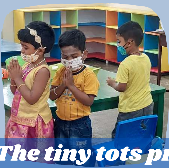
The tiny tots pray