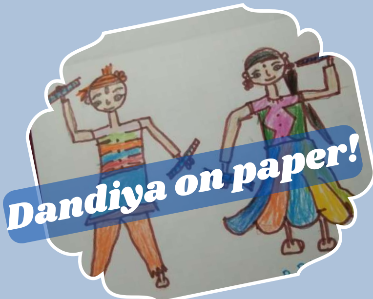
Dandiya on paper!