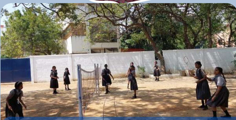
Let the games begin!