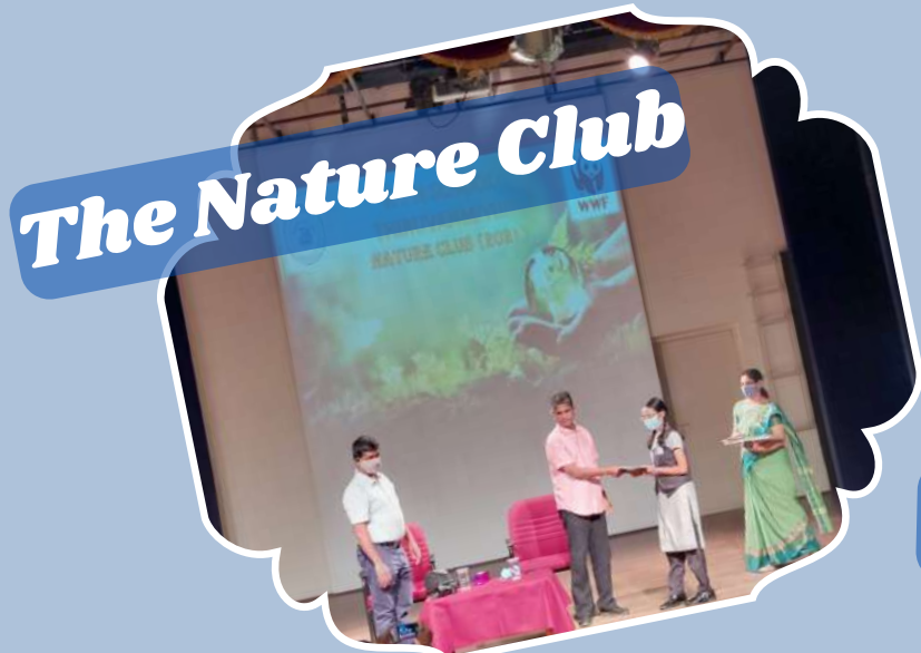
The Nature Club