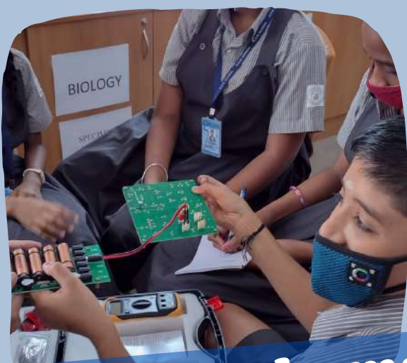
Robots in the making