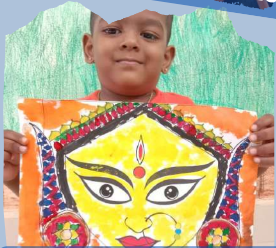
My proud creation